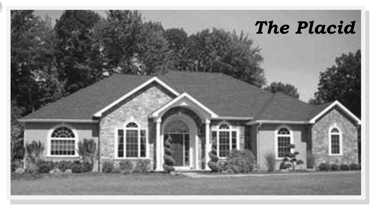
Optional Stucco Exterior on Front Elevation, Optional stone at Garage gable.